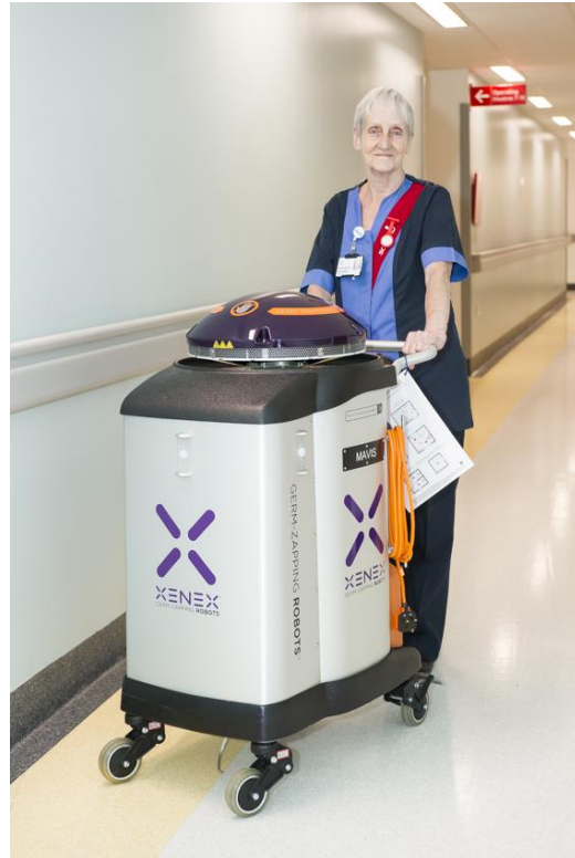
Barking, Havering and Redbridge University Hospitals NHS Trust

Collaboration of human and robot workers to provide an enhanced outcome for patients with Xenex and manual cleaning combined – 91% average bacterial reduction